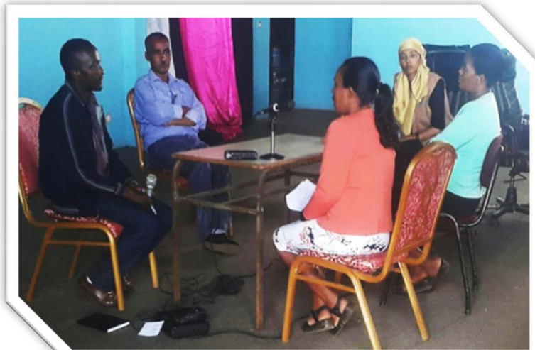
Radio Program Production at the Studio