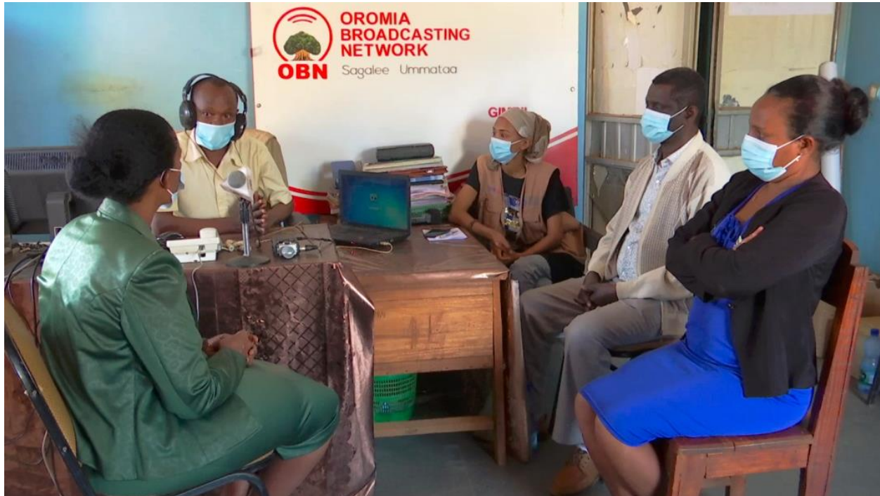
Discussion with the Radio Program Production team lead and local government experts from BoWCYA

Overall, this short, intensive radio programme series combined with outreach activities such as listener groups and looping back to referral and services for survivors has brought in some immediate results in sensitizing the community and reaching large numbers. However, in order for the gains to be sustainable and influence social and behavior change, the intervention needs to continue for multiple years with a strong monitoring evaluation and learning (MEAL) base in order to clearly attribute the results.