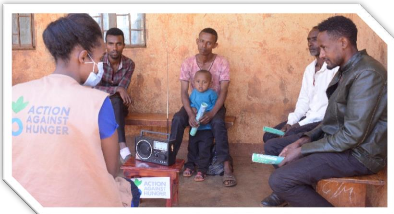
A Protection Officer discussing with Men's Listener Group

Immediate response to the radio programmes and action taken, if any can be measured through an analysis of the feedback from the monitoring, whereas an analysis of the number of cases reported before and after the radio programmes were aired, would provide an indication of action taken by the community members and can be largely attributed to the radio programmes.