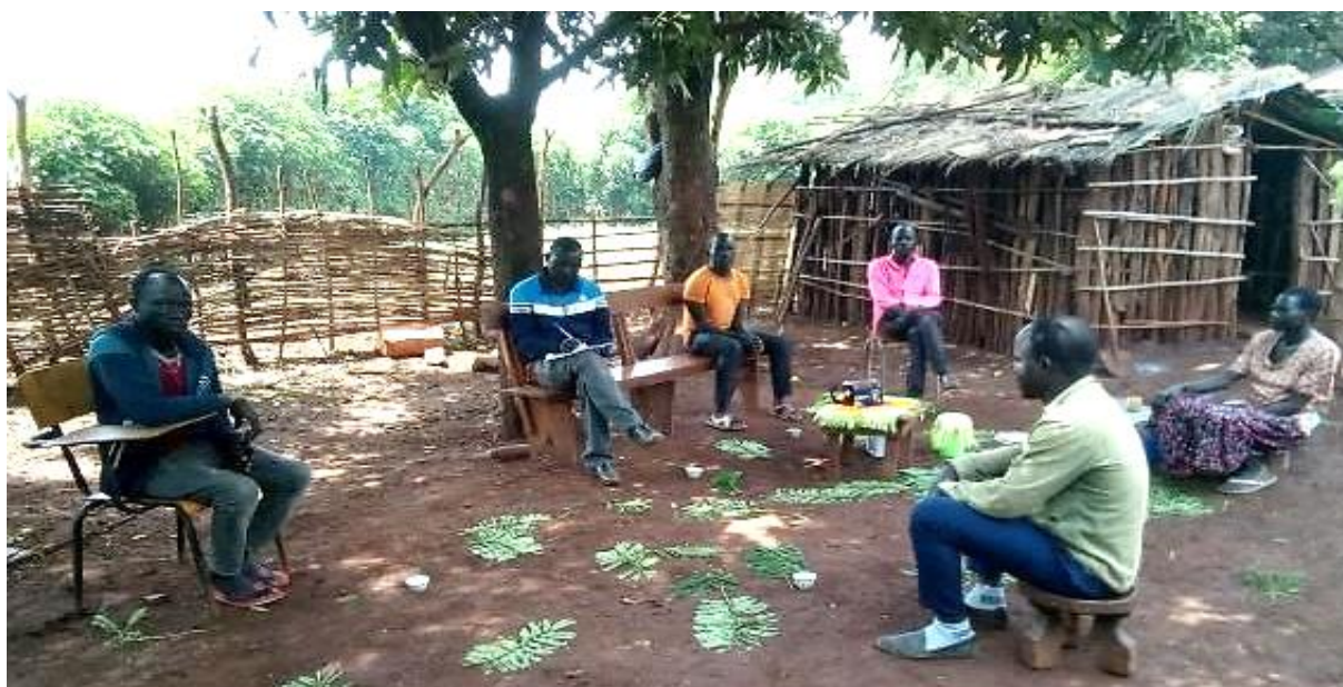
Men's Listener Group meeting during the broadcast

To further engage the community, generate discussions and promote awareness and action on GBV, the Protection team established Listeners' Groups among the beneficiaries in each implementation woreda. Given the sensitive nature of the topic, separate groups of men and women were formed in each woreda.