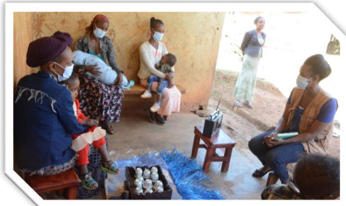
A Protection Officer discussing with Women listeners' group

Intensive monitoring plan were operationalized in the project in view of the fact that as the radio messaging was done using expert interviews and sharing of individual stories in which characters/story lines provide depiction of violent and abusive behaviours and the consequences of these behaviours, there was a greater risk of misinterpretation by the audience than when messaging is more instructional.