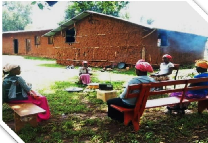
Women's Radio listeners' Group listening to the broadcast

order to promote the date and time of the broadcast. In addition, the broadcast schedule was circulated among AAH teams for further dissemination at the community level.