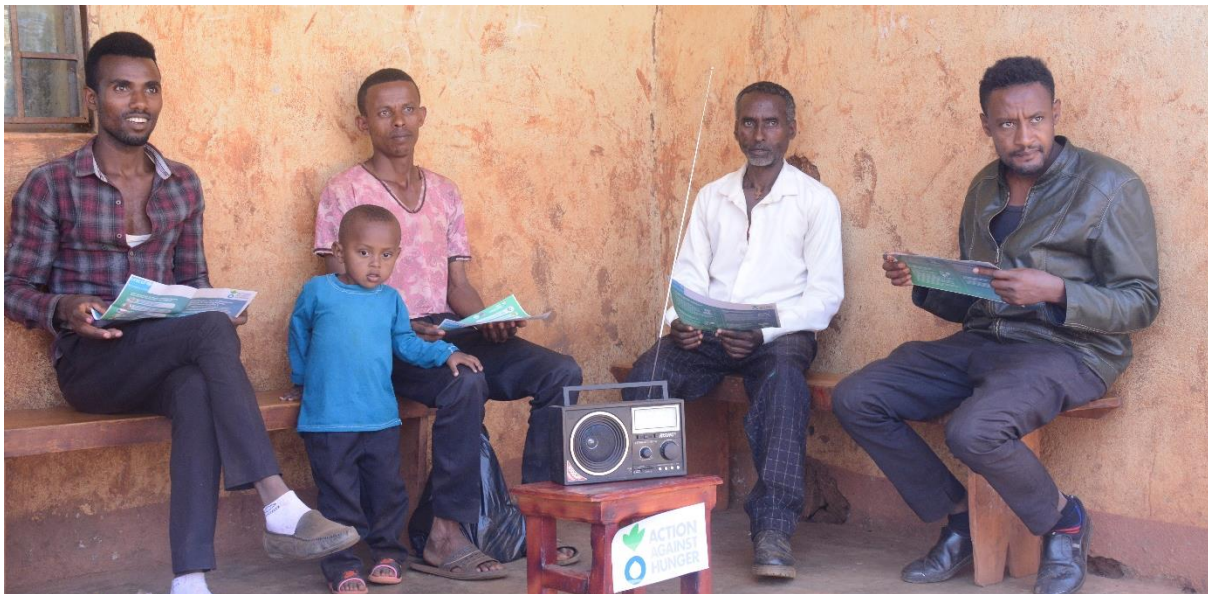
Men's Radio listeners' group discussing and filling their journal

The methodology adopted for monitoring was two-pronged: a) After the broadcast of each episode, the team conducted in-depth interviews (IDIs) with audience members using the ORID (Objective, Reflective, Interpretive, and Decisional) approach. b) The journals from Listener Groups were analysed after each broadcast to collate feedback and share with the producers for any modifications required for upcoming episodes. A guidance note with the required tools for IDIs and the journal format was developed and shared with the team.