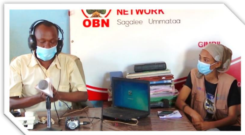
The Protection Team with the Journalist at the OBN studio