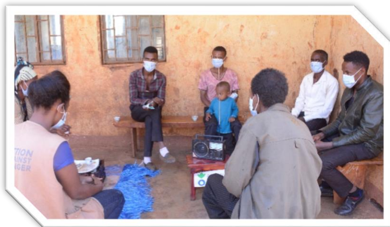
Radio Program Listeners' group in rapt attention during the broadcast