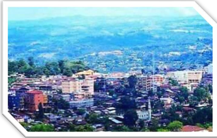
Gimbi Town where Action Against Hunger Wollega base is located