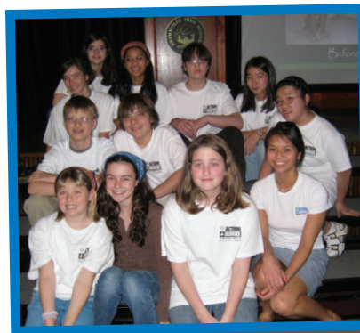
Global Ambassadors Club at the Bronxville Middle School

All of your efforts have made this year's Race a HUGE success. Thanks again for your enthusiasm and dedication. We are looking forward to working with you again for the Race Against Hunger 2009-2010!