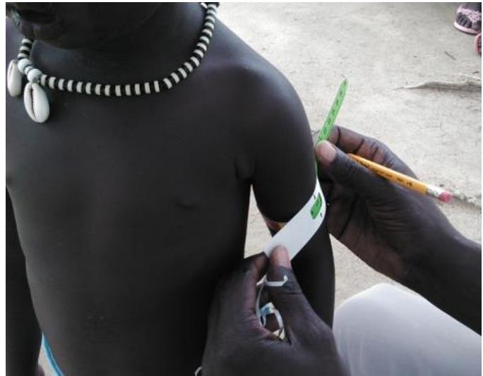
A child's middle-upper arm circumference (MUAC) is measured to detect malnutrition.

In terms of CCTs and stunting outcomes, evidence has shown that larger CT amounts can lead to better child linear growth outcomes (Fernald et al., 2008) and transfers of between 15% and 30% of the overall household expenditure have more observable impacts on nutrition outcomes (Leroy et al., 2009, Fiszbein et al., 2009, Gertler, 2004). In some cases, the amount of CT has been perceived to have an impact on well-being e.g. Brazil (Barrientos and DeJong, 2004). No evidence exists looking into whether transferring different amounts of cash are associated with varied levels of impact in preventing undernutrition in emergencies (Bailey and Hedlund, 2012).